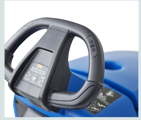
Ergonomic handle with touchpoints, One-Touch™ button and instruction stickers makes the machine simple for the operator to get started