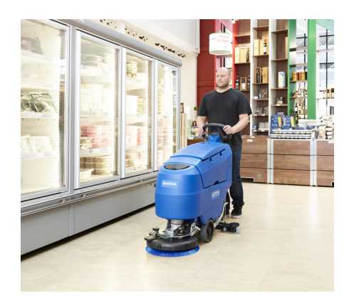
The Nilfisk SilentTech™ technology reduces the sound level from 65dB(A) - and down to 60dB(A) in silent mode