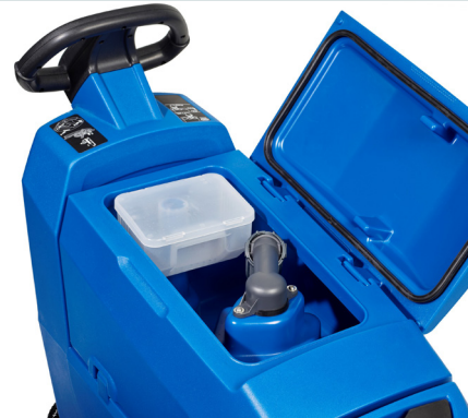
Full access recovery tank makes it easy to clean and the debris tray will prevent any large debris to enter the tank