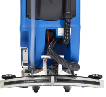
Increased suction performance with the curved squeegee system and patented blade retainer